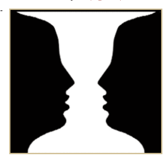
FIGURE 5—A classic example of figure/ground is Rubbin's vase. What are you looking at here? Is it a white vase on a black background or two profiles of black faces on a white background?

When you look at something, what you see is partially determined by what your own mind brings to the act of perceiving, such as your past experiences and expectations. Gestalt psychologists studied how people perceive information and believe that there's interplay of tensions among shapes on a