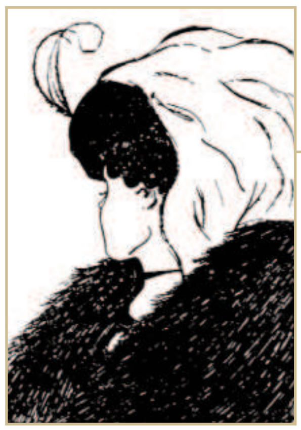
FIGURE 10—An ambiguous figure/ground occurs when your eye travels back and forth between the foreground and the background trying to find a focal point. This famous image is an example of ambiguous figure/ground. From one point of view you can see an old lady with a big nose. But can you also see a young lady looking away?

■ Ambiguous figure/ground—One figure may turn out to be made up of another or of several different pictures (Figure 10).