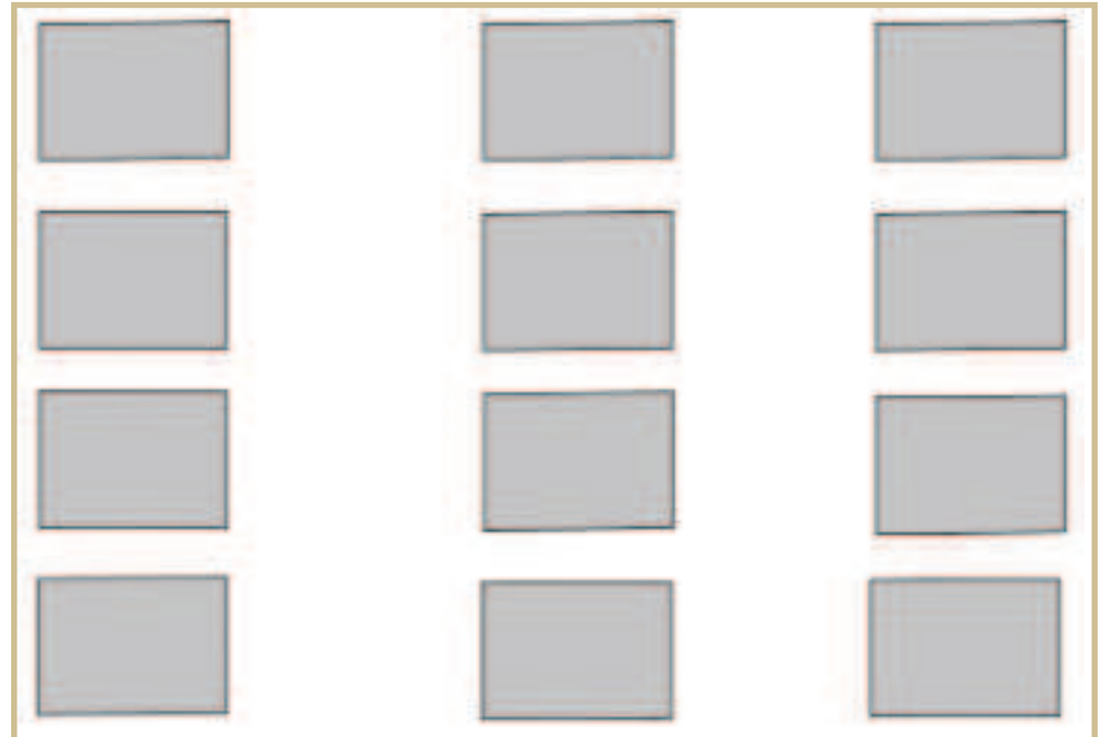
FIGURE 2—Elements that are close together will be perceived as an object. In this case, the same colored squares are used, but their proximity creates columns.

2. Proximity —Grouping by similarity in spatial location; nearness (Figure 2)